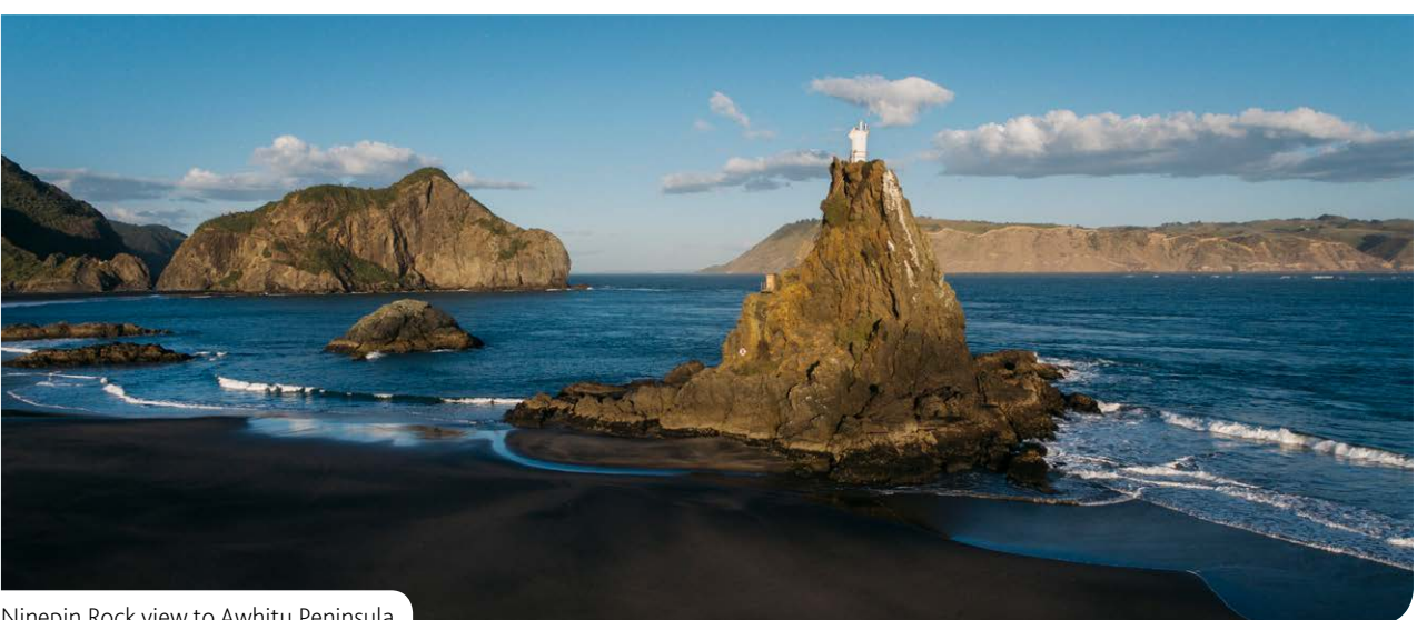
Ninepin Rock view to Awhitu Peninsula

You can read about our progress, expenditure, service performance and challenges faced in 2018/2019. It's of the wider annual reporting package for the Aucklar Council Group and meets our Local Government Act obligations to report on our performance against agr measures. It also reports against the council's Long-te Plan 2018-2028 (10-year Budget 2018-2028) and th Waitākere Ranges Local Board Agreement 2018/2019 This report also reflects the local flavour of your area profiling its population, people and council facilities. features a story about a council or community activit adds special value to the area and demonstrates how together we're delivering for Auckland.