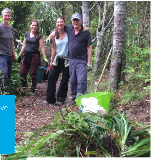
Members of the South Titirangi Neighbourhood Network tackling pests and weeds across South Titirangi

"We are already seeing great results, especially among our bird population. Kaka sightings are up and fantail numbers have increased. As well as recent sightings of tomtits, we are looking after grey-faced petrels nesting."